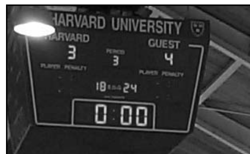
The scoreboard says it all...

Travel to Boston in February is relatively inexpensive, and hotels are easy to come by. Seeing the Big red play in Cambridge is a fan's delight! It's a great opportunity to see the team, see old friends, and recall some of those old cheers.