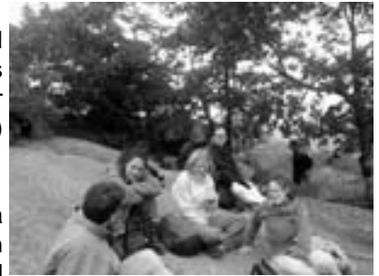
CCW and Cornell-in-Washington hikers at the top of Old Rag!

Alumni and Cornell-in-Washington students will climb Old Rag Mountain near Sperryville, VA. This is one of the Washington area's most popular excursions, and we expect a large turnout (25-40) each time we go.