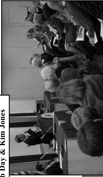
Over 120 alumni and guests attended