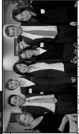
Cornell's China and Asia-Pacific Studies program students