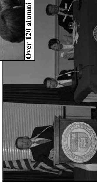
Panelist Congressman Mark Kirk