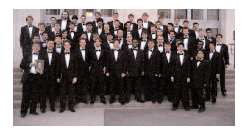
Cornell Glee Club at the Kennedy Center

Saturday, January 9, 7:30 pm Kennedy Center Terrace Theatre 2700 F Street, NW, Washington, DC