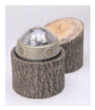
Tree Stump listening device, US CIA, early 1970s

Saturday, November 7, 10:00 am International Spy Museum 800 F Street, NW, Washington, DC