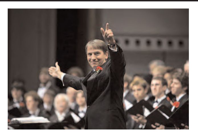
Cornell Glee Club at the Kennedy Center

Saturday, January 9, 7:30 pm Kennedy Center Terrace Theatre 2700 F Street, NW, Washington, DC