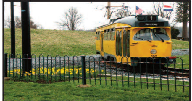
A tram from The Netherlands is on display in the National Capital Trolley Museum's collection of streetcars.

The Cornell Club of Washington is arranging for a family-friendly afternoon of programs, unlimited rides and special features at the newly relocated National Capital Trolley Museum. This event, to be held on September 10th, promises to be a great one to help launch the Cornell Club's 2011-2012 programming year and the new school year. So mark your calendars now and plan to attend.