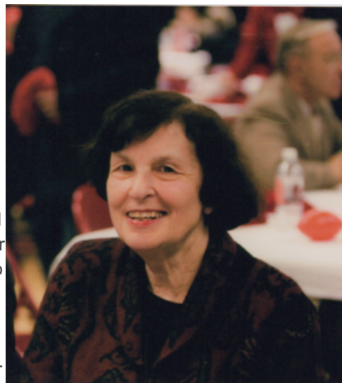
CCW President from 1988 to 1990