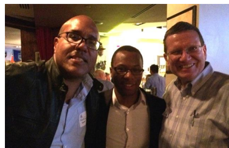
Cornellians celebrating the spirit of International Zinck's Night!