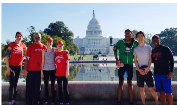
Cornell alumni enjoying the Homecoming Virtual 5K Run

The weekend of October 21 st was Homecoming. Those of us in the DC area who could not make it back to Ithaca to participate in the festivities did not let the 300-mile divide keep us from showing our Cornell spirit. On that sunny, 60 degree Saturday morning, a group of Cornell alumni participated in Cornell's World-Wide Homecoming Virtual 5K. The Cornellians met on the Washington Mall, jogged around the Washington Monument, hit the Lincoln Memorial Reflecting Pool, looped around the Lincoln Memorial, and headed back to the steps of the Capitol. Like many other Cornellians around the world who participated virtually, the group shared their photos with the Cornell community via social media. A scenic trot interspersed with conversation continued to strengthen the Big Red bond in the nation's capital.