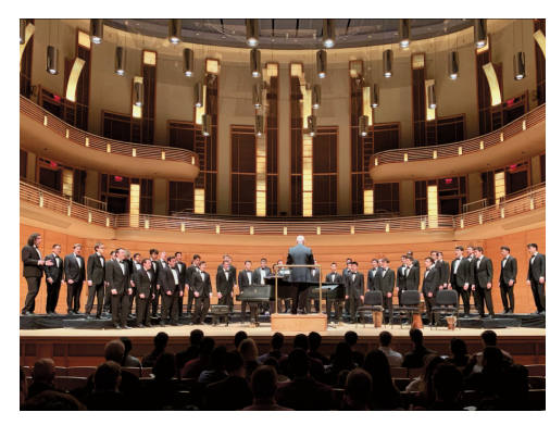
Glee Club in Concert at Strathmore Hall, 1/12/19